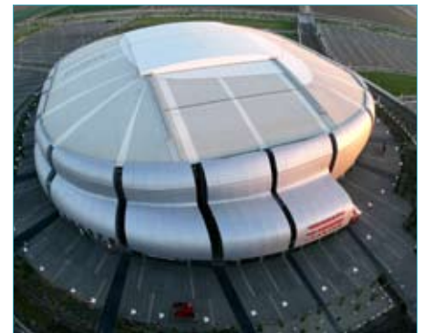
University of Phoenix Stadium, whose exterior 'skin' represents a barrel cactus, was designed by Uni-Systems to have the country's first fully retractable natural-grass playing field.

In the late 1960's, Uni-Systems, LLC (Minneapolis, Minnesota) was established to develop moveable structures for aerospace giants such as Boeing Aircraft, American Airlines, and Cape Canaveral Air Force Station. Later, the company branched into the military, construction, entertainment, and, in more recent years, sports industries. Uni-Systems has designed, fabricated and installed the mechanization components for five of the last six retractable sports-stadium roofs built in North America, including Reliant Stadium and Minute Maid Park (Houston, Texas), Lucas Oil Stadium (Indianapolis, Indiana), Cowboys Stadium (Arlington, Texas), and University of Phoenix Stadium (Glendale, Arizona).